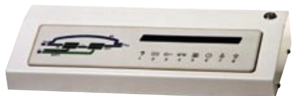
LCD remote panel