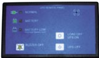
LED remote control panel